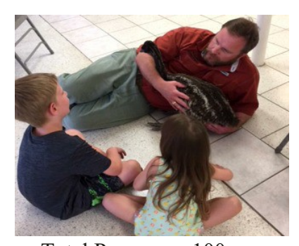
Total Programs: 100 Program Attendance: 881